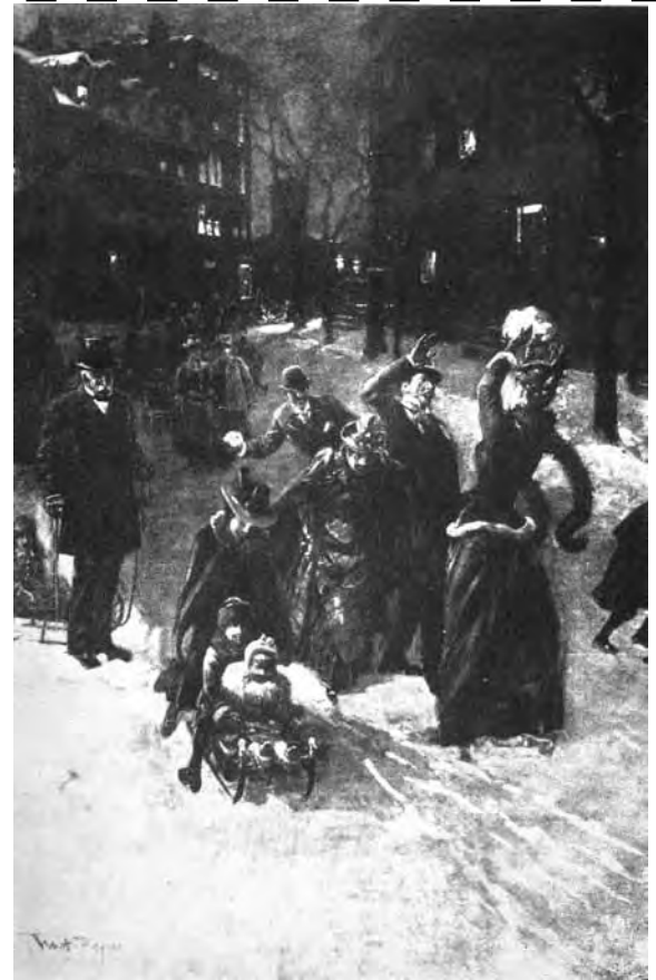
Sleighing on Grove Street