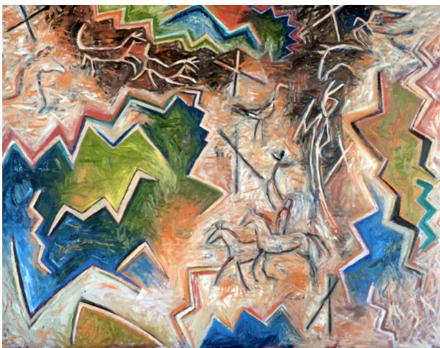
herding by Jaune Quick-to-See