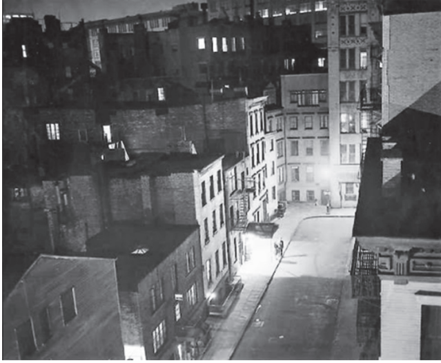
Commerce Street, 1950s

sure will make a huge difference for current and future artists that call Greenwich House their musical home. Tickets, sponsorship, and more info: https://music.greenwichhouse.org/benefit